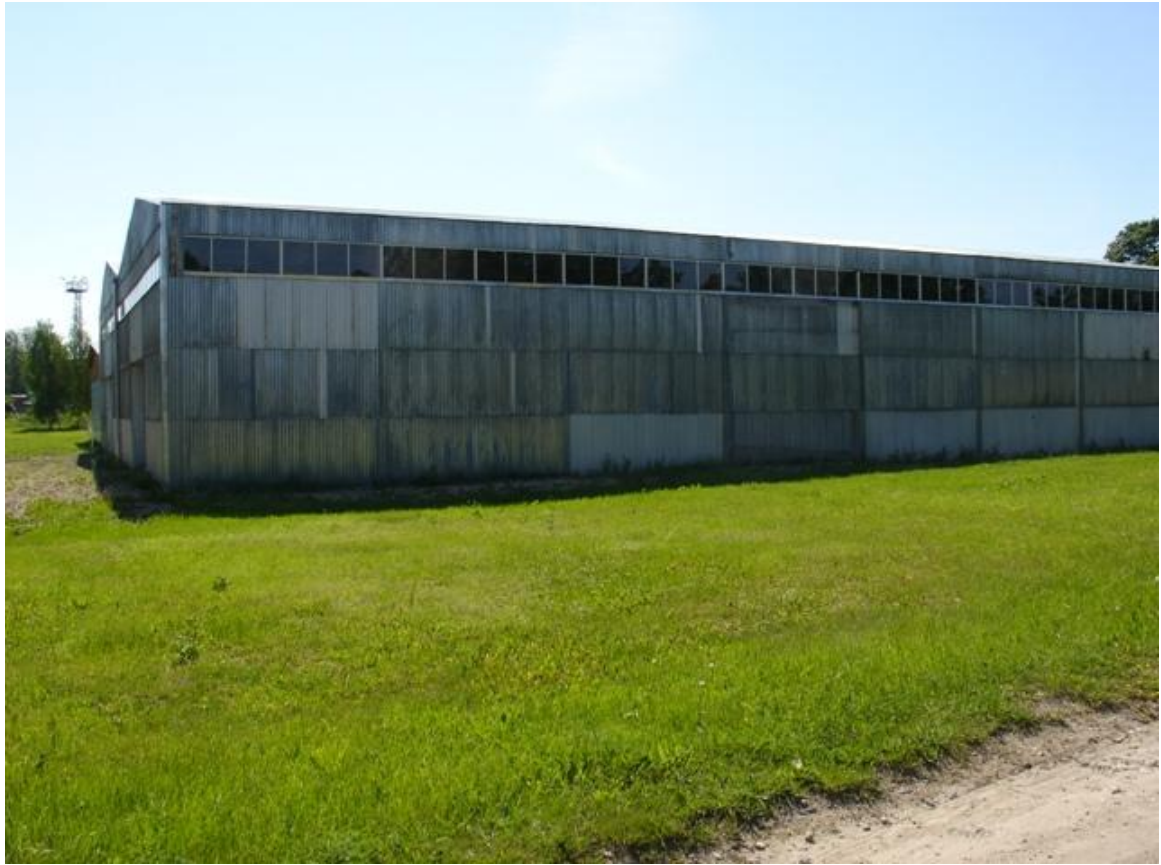
Kaļķu Street 12