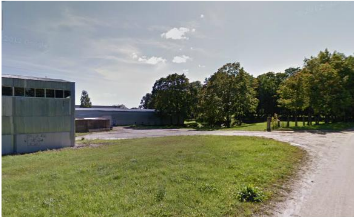
Kaļķu Street 12