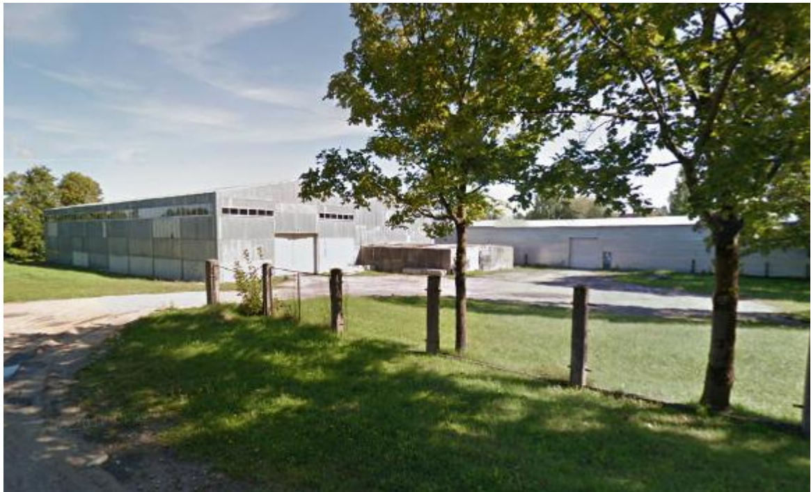
Kaļķu Street 12