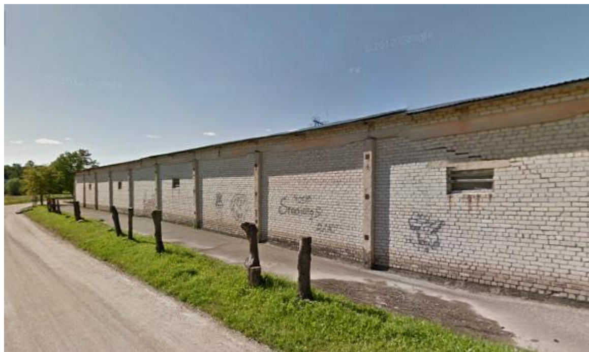
Kaļķu Street 3