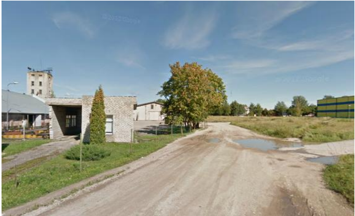
Kaļķu Street 3