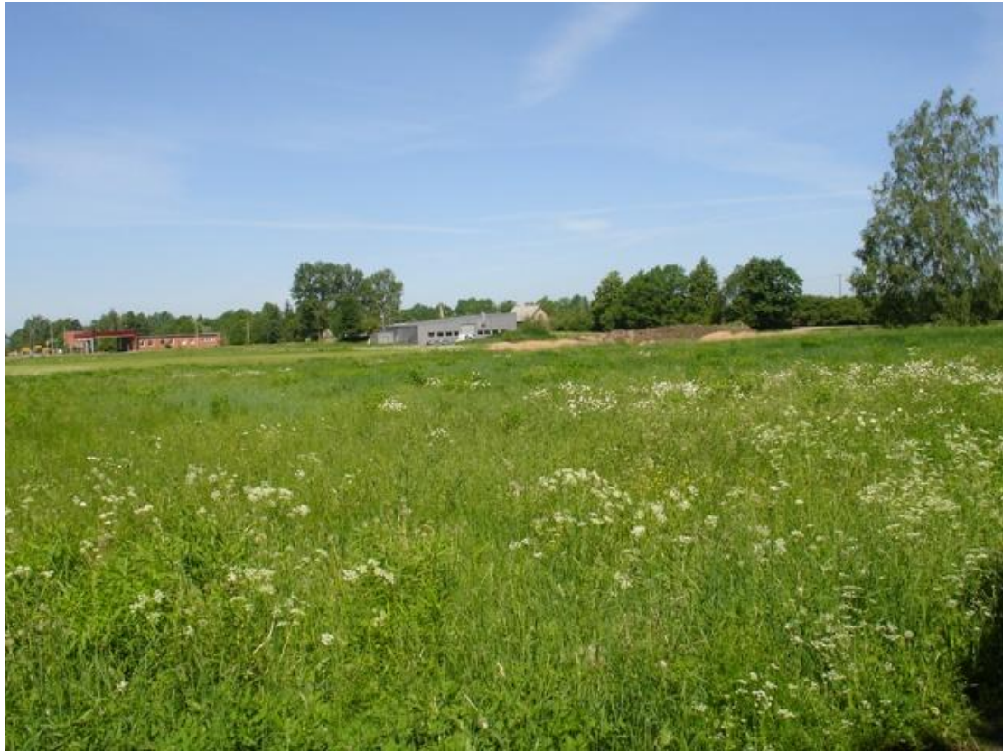
Ābolu Street 3