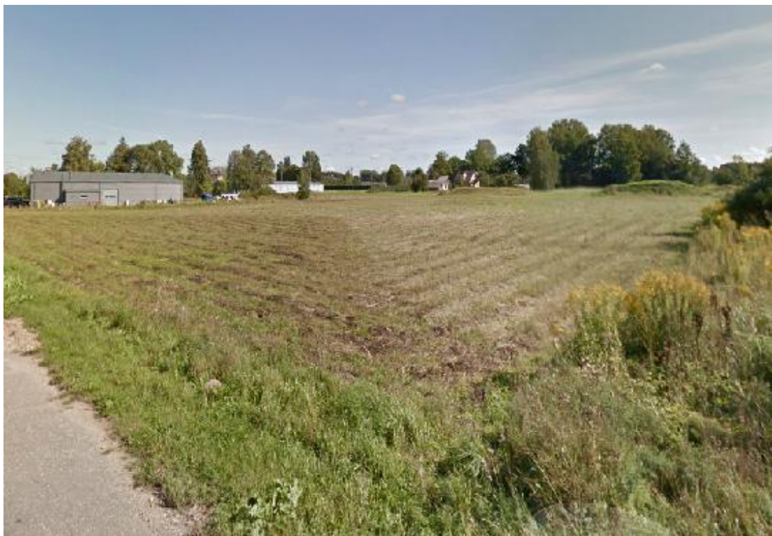
Ābolu Street 3